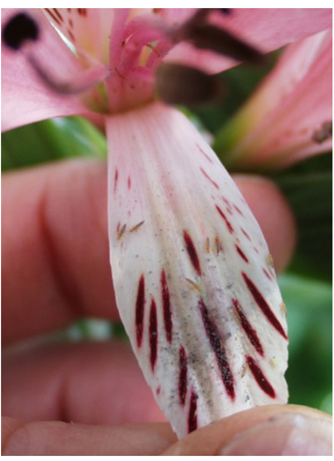
WFT on alstroemeria flower

Using insecticides. Give Conserve a rest if it's not working. Overture, Pylon and Hachi-Hachi are labeled only for indoor use and among the latest products showing good results against WFT. Caution: some plants are sensitive to Hachi-Hachi such as: poinsettia (bracts). impatiens (all types), salvia, gypsophila; petunia flowers; labels note temporary injury to ageratum, colocasia, geranium, lobelia, pansy (flowers), verbena, and vinca. Pylon is not for dianthus, kalanchoe, poinsettia, rose, salvia, or zinnia. Test new products first on any new plant. Mesurol, TriStar, Marathon/Discus (or generic), Avid (or generic), Safari, Flagship, Azatin (or other azadirachtin), Safari, Pedestal, DuraGuard, and M-Pede are other labeled options that may be useful particularly in tank mixes. (Note that some of the products listed above are not registered for use in all states.)