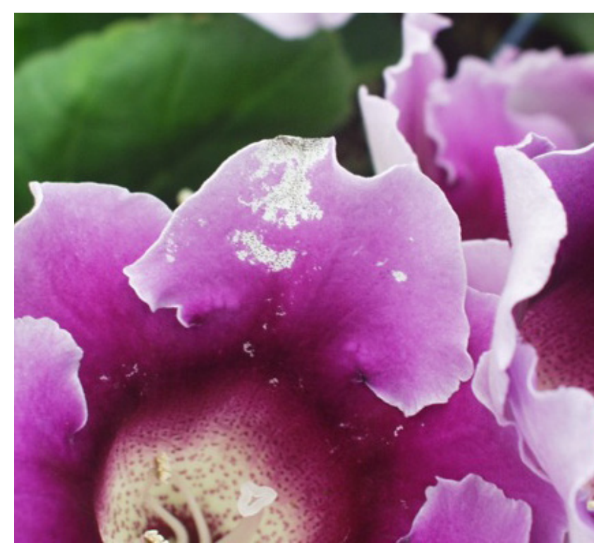
WFT injury on gloxinia

Usually we're talking western flower thrips (WFT) here. All but the newest growers will recall how scary WFT were some years ago, with few effective products to control them. Lots of flower and leaf damage was common, and even worse were severe losses from tomato spotted wilt and impatiens necrotic spot tospoviruses, which they can spread to other greenhouse plants including tomato and pepper transplants. The virus may arrive Trojan horse-like, within cuttings taken from infected mother plants, symptoms appearing later. The thrips then spread it to new host plants. Conserve insecticide changed much of that – a naturally derived product with a natural fit in greenhouses: high plant and worker safety, strong efficacy, not restricted, short re-entry interval, and