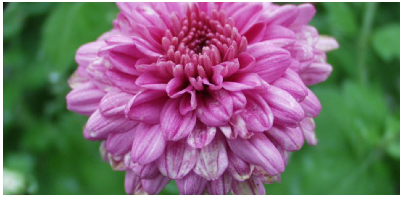
WFT injury on mum flower