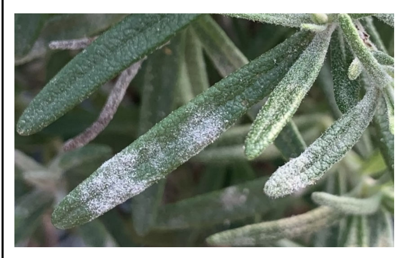
Figure 4. White radiating hyphae producing spores in chains on the leaf surface. Severely infected leaves may turn brown and shrivel (upper left in the image).