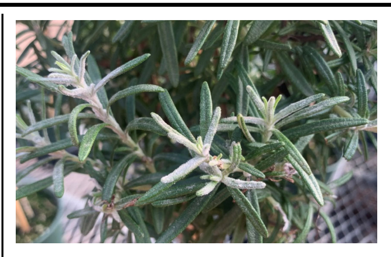
Figure 2. Terminal shoots of rosemary stems completely covered in powdery mildew hyphae and spore.

Infected rosemary plants should be removed to reduce spreading the disease to surrounding plants of the same species/plant family. Remove infected leaves, stems, or whole plants. Infected tissues should be bagged and disposed offsite. Powdery mildew can potentially survive on closely related weed species, so keep weeds in and around the greenhouse to a minimum.