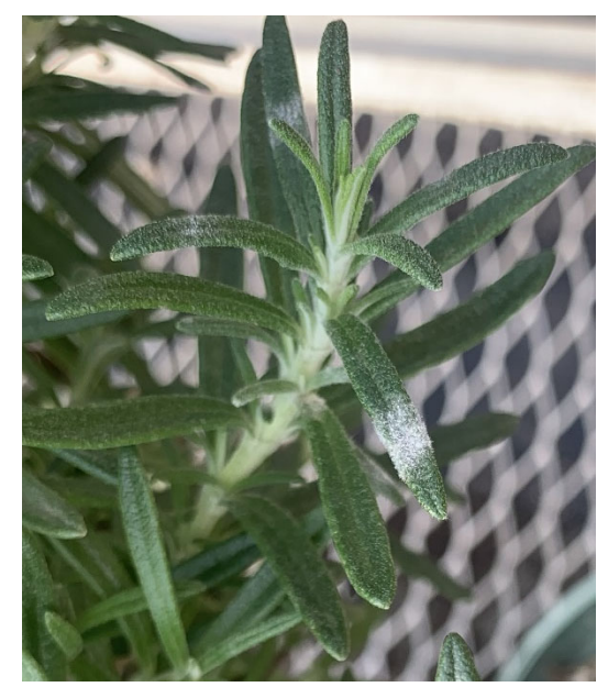
Figure 1. White, powdery patches of powdery mildew infection on rosemary leaves.

Be watchful of powdery mildew disease on herbs at this time of the year. Recently, an outbreak of powdery mildew was observed on greenhouse-grown rosemary plants. Large temperature fluctuations of warm days and cool nights with high relative humidity favors powdery mildew development. Unlike other fungal foliar pathogens that need prolonged periods of leaf wetness, powdery mildew is inhibited by wet leaves. Drier, but humid conditions, with relative humidity levels above 75% is required for powdery mildew fungi to infect and produce new spores.