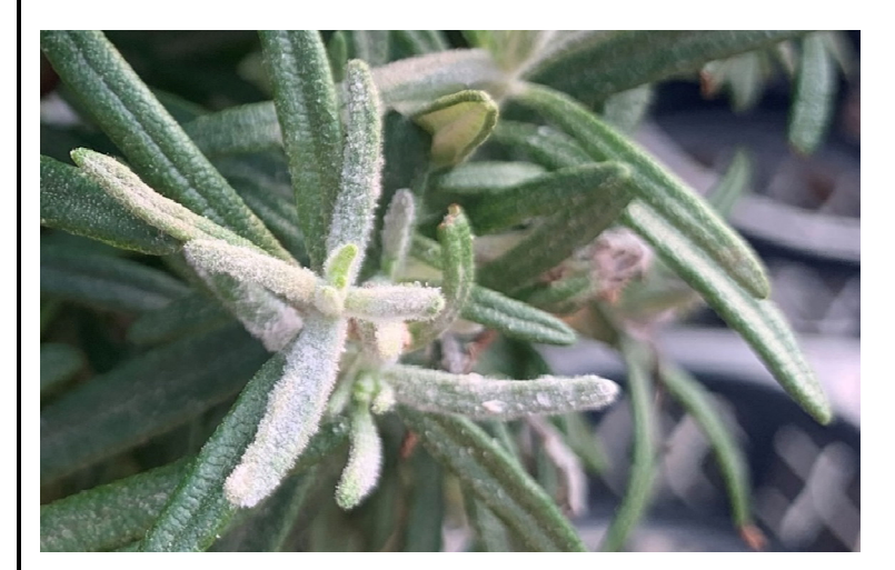
Figure 3. Powdery mildew growth can be dense and may be confused with an insect infestation. Spore growth can is in chains and spores may fall onto the leaves below. (Image by J. Williams-Woodward)