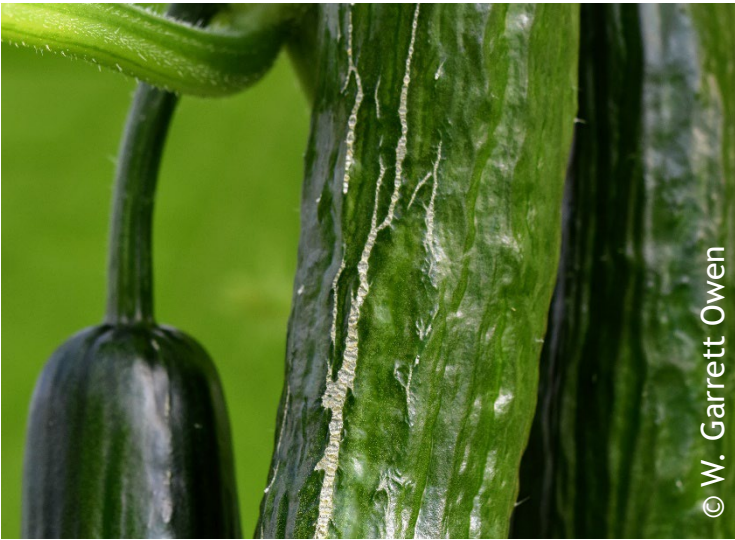
Figure 9. Chilling injury in greenhouse cucumber can cause the skin of developed fruits to exhibit brown surface splits.