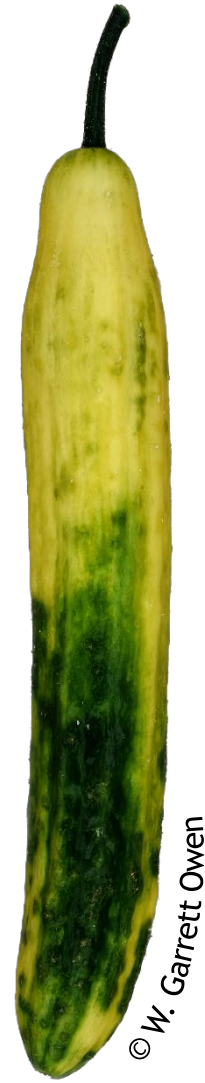
Figure 11. Advance symptoms of chilling injury of greenhouse cucumber fruit include bleaching.