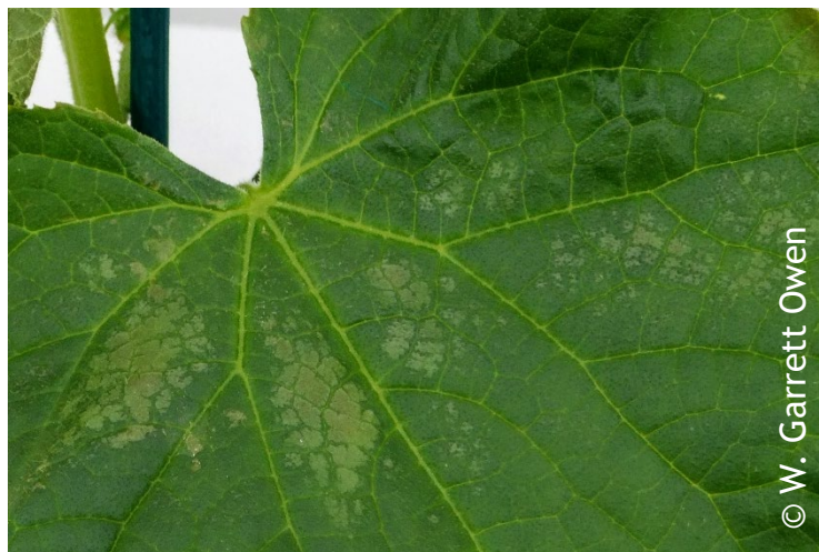
Figure 1. Chilling injury in greenhouse cucumber can cause upward leaf curling. This cucumber transplant was exposed to 46 °F (8 °C) for 16-hours.