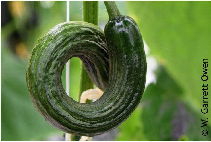
Figure 8. Chilling injury in greenhouse cucumber can cause developed fruits to curl.