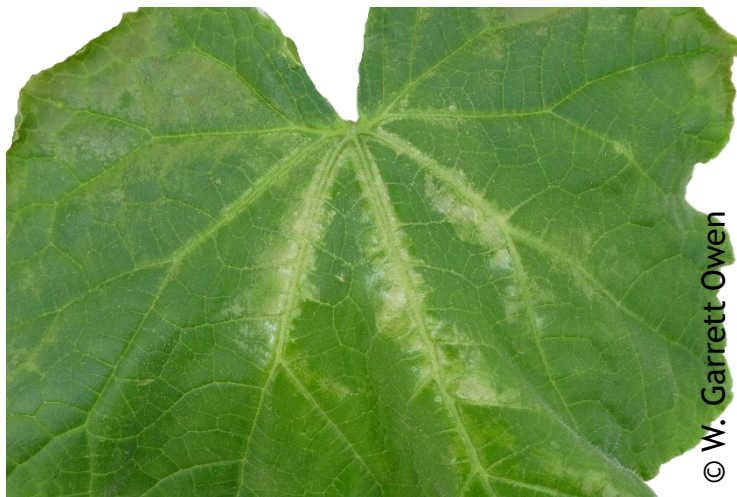
Figure 2. Chilling injury in greenhouse cucumber can cause browning of the young and recently matured leaves. This cucumber transplant was exposed to 46 °F (8 °C) for 16-hours.