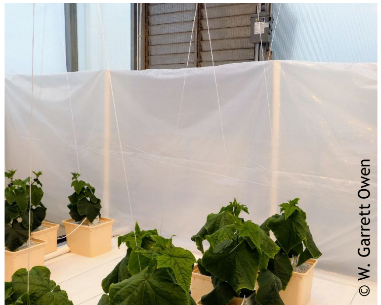
Figure 12. Plastic barriers can be temporarily installed to provide protection from cold air entry and prevent injury.