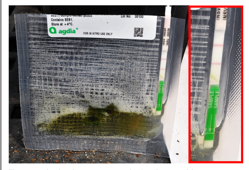
This is a test kit that shows a positive result. Note the two pink lines on the test strip.