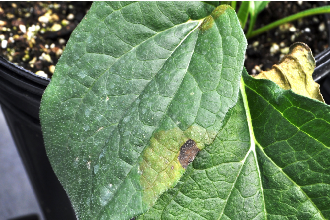
INSV on Monarda didyma top and on Echinacea 'Harvest Moon' bottom.