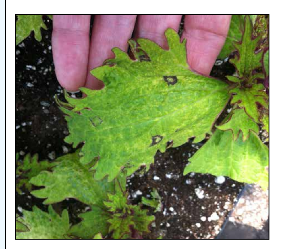
Ringspots caused by INSV.