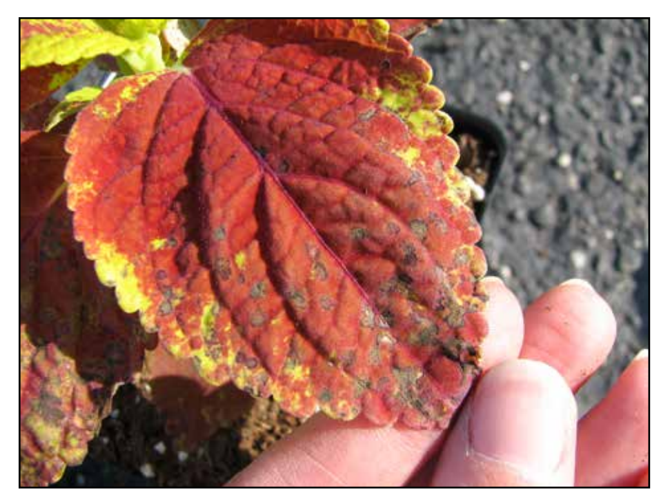
Ringspots caused by INSV.