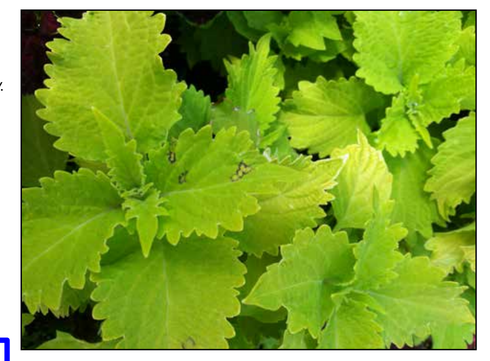
Ringspots caused by INSV.