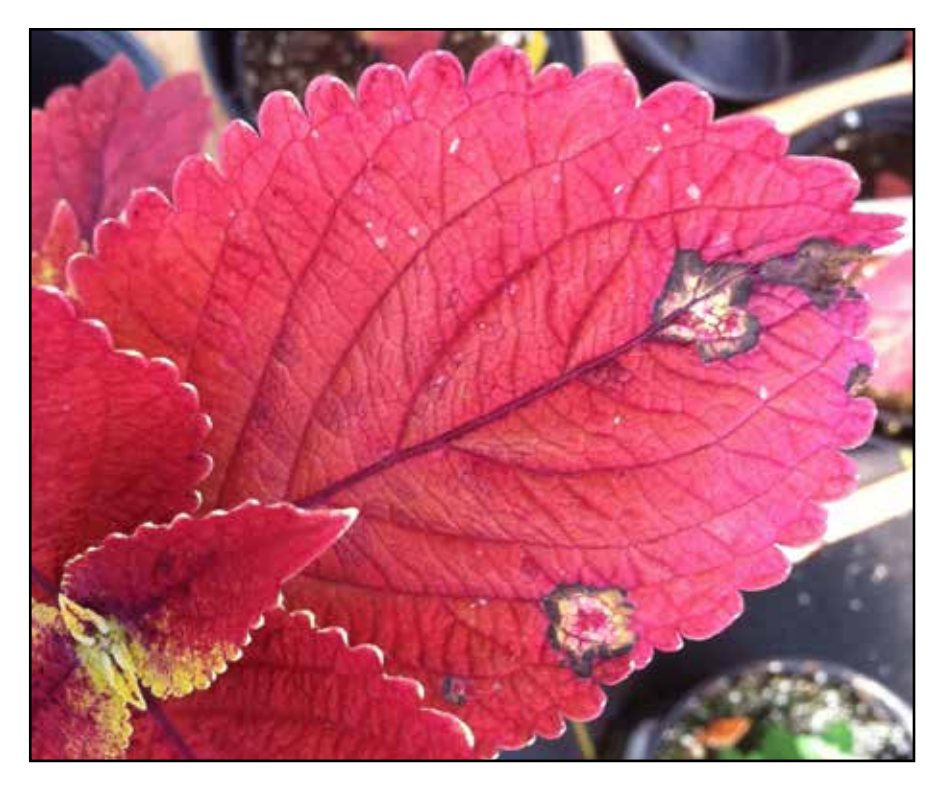
Ringspots caused by INSV.

Where trade names, proprietary products, or specific equipment are listed, no discrimination is intended and no endorsement, guarantee or warranty is implied by the authors, universities or associations.