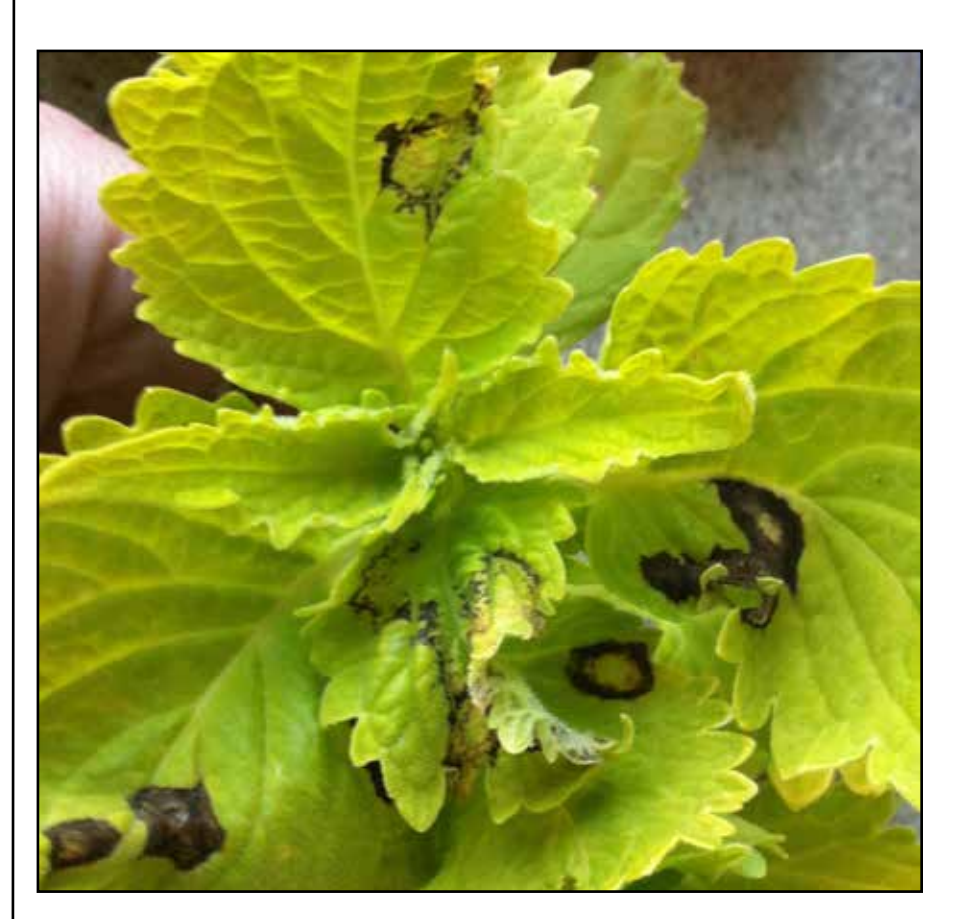
Ringspots and line patterns caused by INSV.

This virus can also be spread through propagation, so be especially careful and scout your stock plants for symptoms and remove INSV-infected plants from propagation.