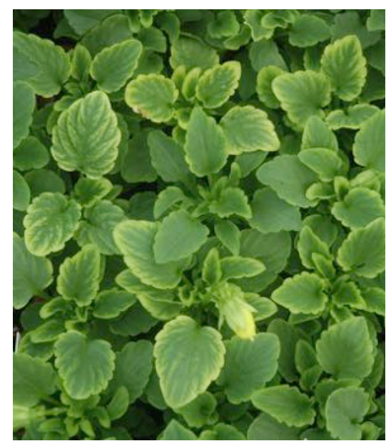
Figure 1. Initial signs of an iron deficiency problem.

In greenhouse production interveinal chlorosis of the upper foliage is commonly associated with iron (Fe) deficiency (Figs. 1&2). Iron deficiency is initially commonly observed as a light green coloration of the new upper foliage, progressing to more pronounced interveinal chlorosis (Figs. 3&4) and finally, in severe cases, total yellowing and bleaching of the foliage (Fig. 5). However, there is a wide range of causes for Fe deficiency including insufficient Fe fertility, high substrate pH, or overwatering. If only a few scattered plants are infected,