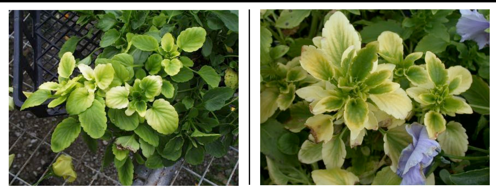
Figure 5. Advanced symptoms of leaf bleaching due to an iron deficiency induced by excessive high substrate pH levels.