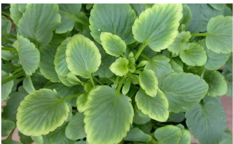
Figure 2. Interveinal chlorosis of the upper foliage due to an elevated substrate pH.