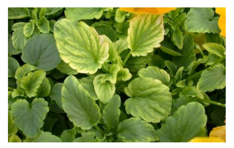
Figure 3. Intermediate interveinal chlorosis due to elevated substrate pH levels.