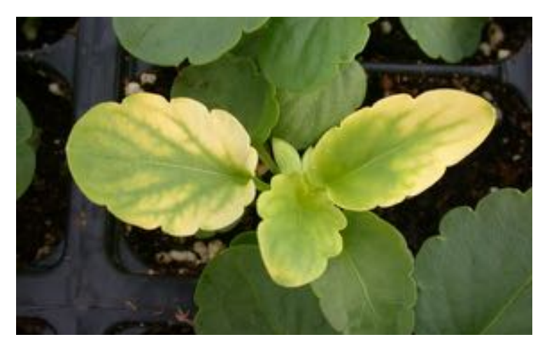
Figure 4. Distinctive interveinal chlorosis symptoms due to an elevated substrate pH.