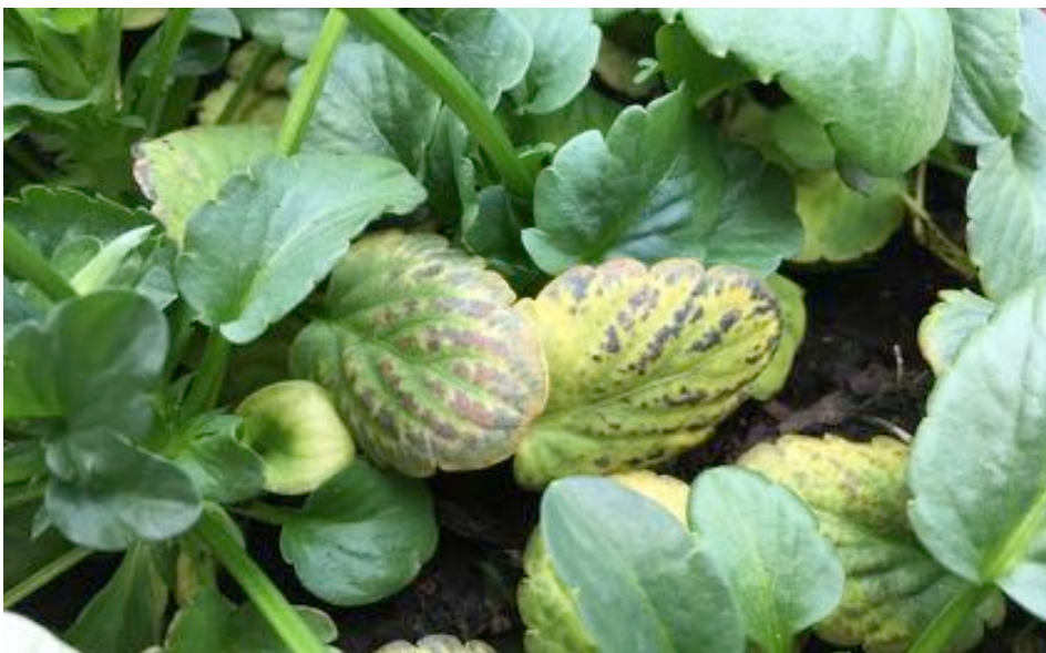
Figure 3. Another example of pansies with lower leaf purplish-black discoloration due to low substrate pH. Plants were held for a prolonged period of time.

Monitor pansy crops to ensure that the substrate pH is within the recommended range of 5.5 to 5.8. Stress from cool growing or finishing/toning temperatures can sometimes lead to problems. One possible reason is that almost all fertilizers are acidic when mixed. The acidic effect of the fertilizer can have a greater influence on lowering the substrate pH than the acidic/basic reaction that occurs with nutrient uptake by the plant. If plant growth stalls, the acidic impact of the fertilizers will then drive down the substrate pH. If this trend continues, the substrate can quickly drop below the desired pH range.