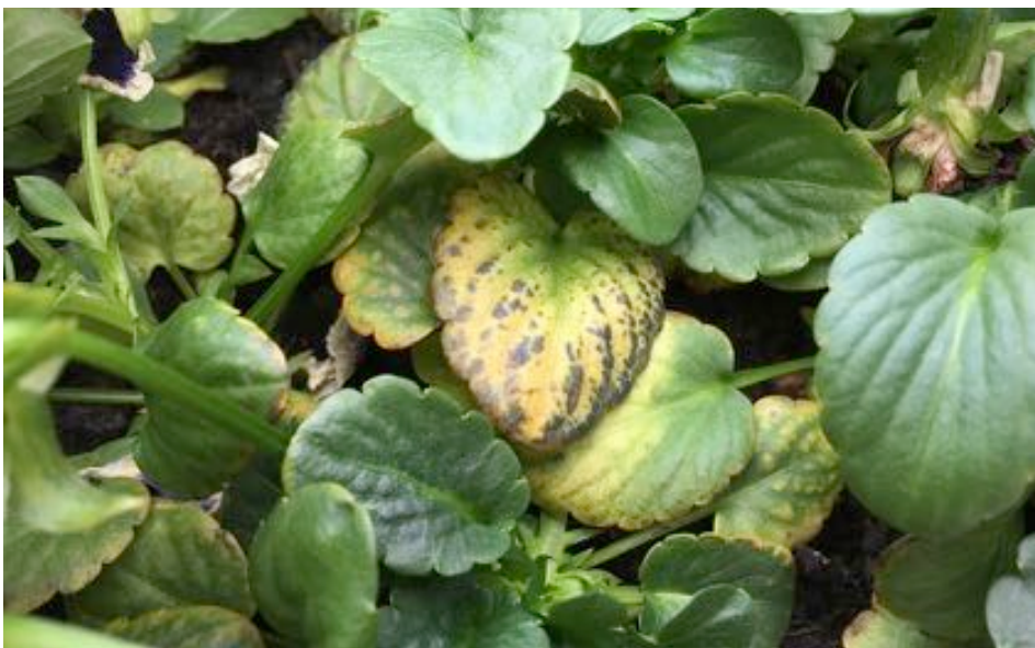
Figure 2. Lower leaves of pansy plants turning purplish-black due to low substrate pH. Plants were grown for a longer period of time and held over the winter.

A tissue sample was submitted for nutrient analysis. The recommended range for pansies is 30-300 ppm iron (Fe) and 25-300 ppm manganese (Mn). Elevated levels of Fe (3640 ppm, >12X higher than the upper limit of the recommended range) and Mn (3050 ppm, >10X higher than the upper limit of the recommended range) were determined in the leaf tissue of the symptomatic pansies.