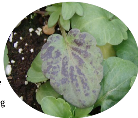
Figure 1. Lower leaves of pansy plants exhibiting purplish-black spotting due to low substrate pH. Symptoms typically appear when the substrate pH is 5.0 or below.