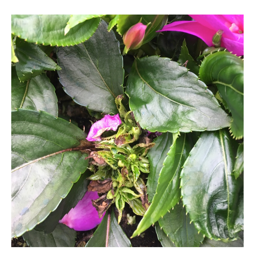
Strong stunting on this New Guinea was associated with TSWV infection