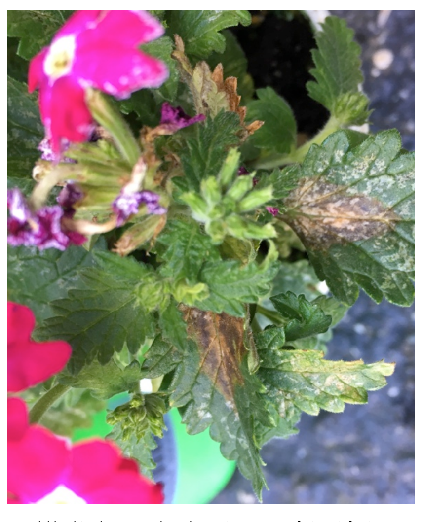
Dark blotching here on verbena leaves is symptom of TSWV infection. Pale scarring on leaves is from thrips feeding.

Twospotted spider mite (TSSM) on zonal geranium: I didn't think zonals were a host for TSSM until I started seeing infested plants about 20 years ago. Mite-damaged leaves initially appear to have symptoms resembling a disease problem so samples usually arrive via the Pathology Diagnostic Lab. Older foliage can have brown, dead spots or areas, and yellowing, with edema on the underside especially between veins close to the petiole. Younger leaves may have these symptoms and possibly some distortion. The symptoms are not especially typical for TSSM, which more often causes a kind of pale flecking or bronzing on other kinds of plants like tomatoes and roses. As with broad mite above, I only encounter TSSM on vegetatively propagated zonals, never on seedgrown plants. Due to the plant architecture and difficulty getting really good coverage under older leaves when using contact miticides, we decided upon a translaminar product (or at least to include in the rotation or tank mix) and then to evaluate the results, to make sure we weren't dealing with a miticide-resistant population. With our array of miticides to choose from a back-up plan was discussed, if necessary. I recently checked a sample from the crop and it is good news: no mites. The few damaged leaves in the crop are easily removed or will be covered by new growth and the crop should look great when it's sold in a couple of weeks.