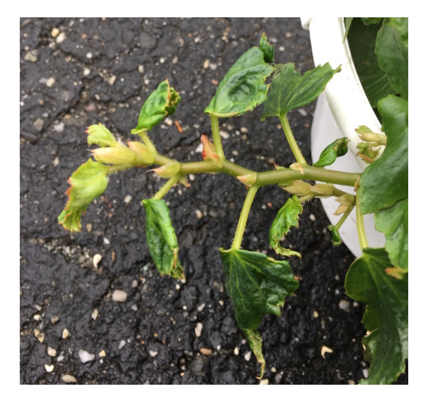
Leaves on begonia distorted from broad mite infestation