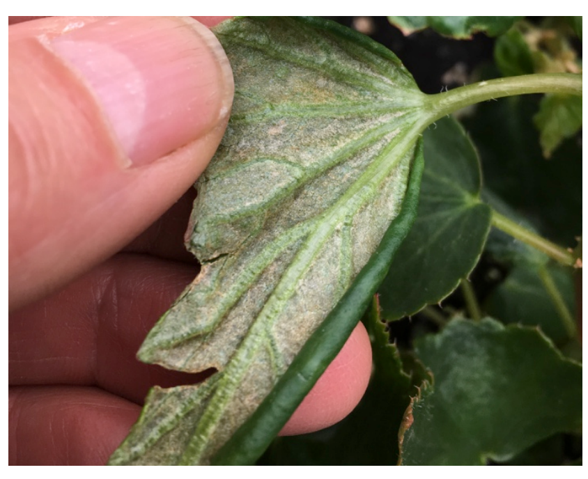
Bronzing and curling on begonia leaf is typical of broad mite damage