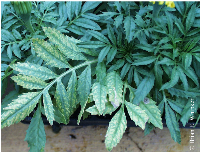
Figure 2. Low substrate pH results in the lower leaves developing a bronzing coloration due to the accumulation of iron and manganese (toxicity).

Substrate pH values above 6.5 can also inhibit iron availability. This is why the optimal substrate pH range is between 5.8 and 6.2 (Fig. 4). The range of 6.2 to 6.4 is the point in which corrective procedures should begin.