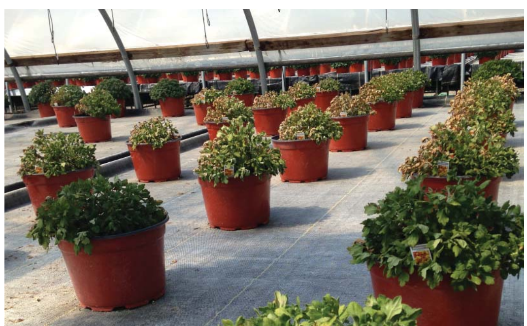
Figure 3. Chrysanthemums presenting injury caused by high EC in the growing medium. DEspite the tolerance for high salt levels in the roots, chrysanthemums can also developbe affected by high salt content. Therefore, it is essential to monitor even those crops that we consider very tolerant to changes in growing medium.

For more information on the importance of pH, specific crop requirements and management go to: http://www.e-gro.org/pdf/2017_610.pdf