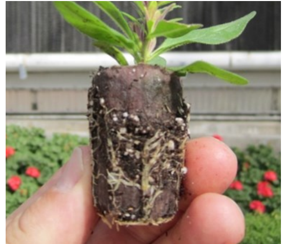
Figure 3. Seedling plug and liner crops are grown in relatively small cells, and media pH and EC can fluctuate more rapidly compared to larger container crops.

species differ in their effect on media pH even when supplied the same fertilizer (Argo and Fisher, 2002; Johnson et al., 2013). For example, geranium tend to push pH down whereas petunia tend to push pH up. Therefore, geranium require low-ammonium fertilizers to help prevent pH from decreasing and petunia can be supplied with more ammonium to help keep pH from increasing. Watch out for plant species that appear to increase or decrease pH more rapidly than others, and consider adjusting the fertilizer program or starting media pH if these crops consistently run into nutritional problems.