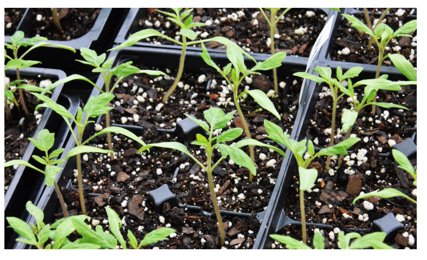
Fig. 2. Tomato seedlings expressing temperature driven stretch just after transplant. The stretch started in the plug tray.

If daily temperatures increase, so does the rate of reproduction for many greenhouse pests. One grower was surprised by a rapid increase in spider mites. To save money many small growers delay costly spraying programs until the populations appear. This year, mite populations, shore fly and fungus gnat populations were exploding in January. Once the issue arose, money was spent. Their pesticide cost budget is now looking grim. Scouting pays for itself!