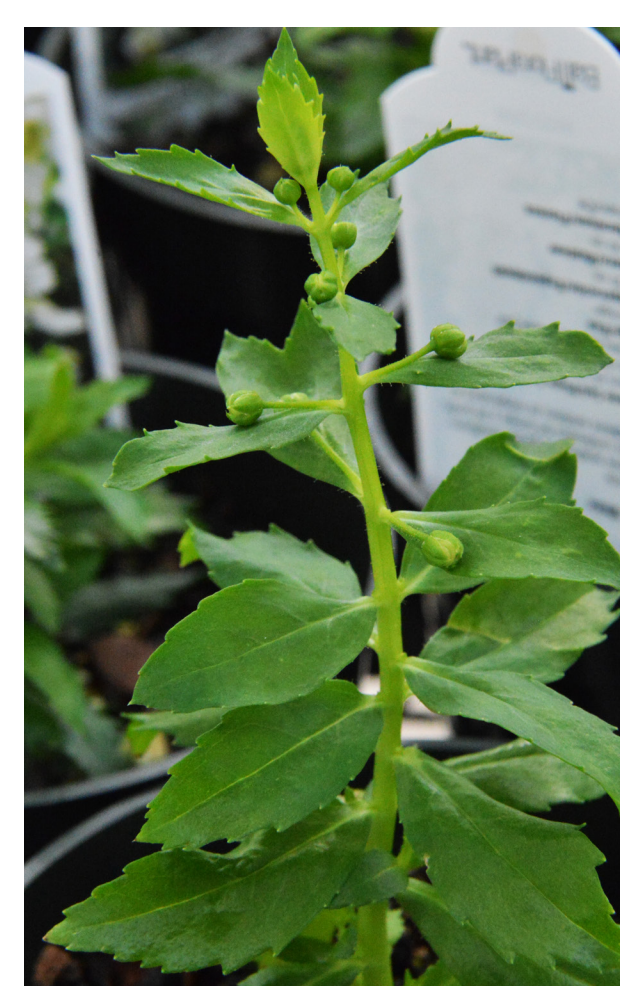
Fig. 5. Angelona showing the increased afternoon heat experienced two weeks ago . Note the grower regained control.

We are likely going to continue to see warmer winter and spring temperature fluctuations. If you don't happen to have the infrastructure to deal with this using automated systems, build a winter "heat wave" scouting plan and stress using sticky cards, temperature / light monitoring, pH/EC testing, options for ventilation and shade application options and please, consider using the low rates of PGR for winter season appliaction. We can't control the weather, but we can reduce it's impact on our crops.