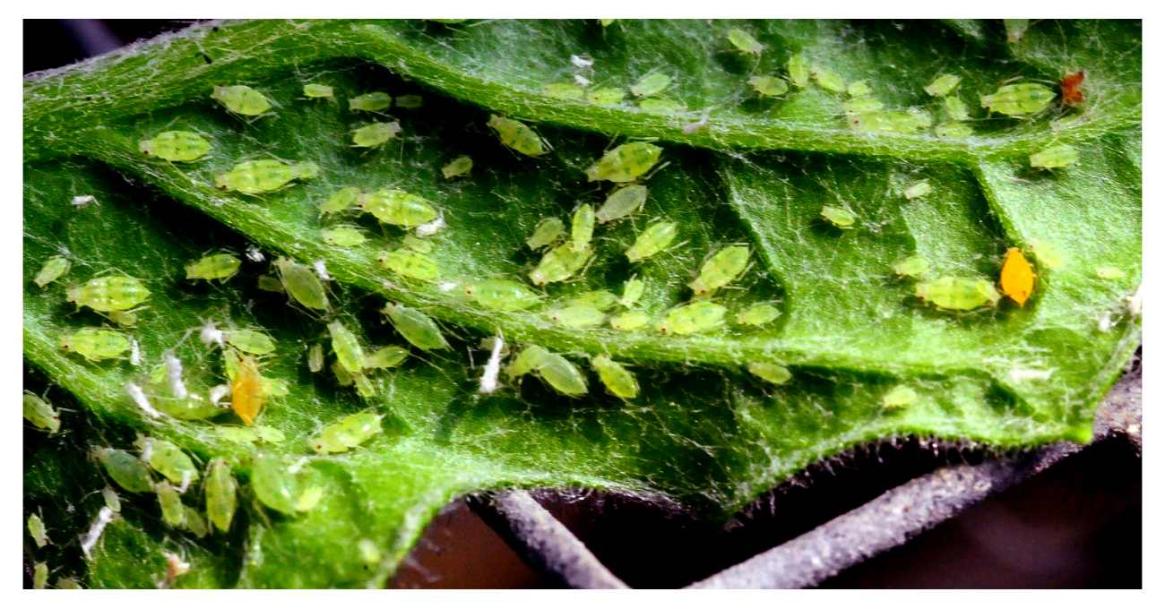
Fig. 3. An almost uniforn, first-wave generation of aphids brought on by the temperature spike.

ferns can be affected by the heat in different ways. Ferns love heat, but the increased evaporation requires more frequent irrigation. For large operation using drip, or sensor driven fertigation systems this is not an issue. For small operations that water and fetilize by hand, it is. Growers usually put these kinds of easy-to-grow plants on a simple fertility schedule, independent of watering. In January, large fern baskets frequently don't need watering between fertilization. This year they were being watered several times a week. The end result was pale, hungry looking ferns. When I checked soil EC, it was down to 0.21 mS. No wonder they looked hungry. Ideal EC levels are around 0.8 mS But wait! There's more! One grower whom had small fern liners freshly planted in 10" baskets, and was using a continuous feed program, noticed a bit of tip burn on the fronds. A check of the EC revealed a 2.64 mS EC. This is way above the industry recommended EC limit of 1.0 mS. His constant feed was only 75 ppm. What was happening was strong