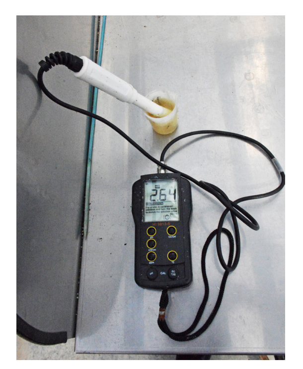
Fig. 4. A very high EC level for Boston Ferns caused by high temperatures and high evaporation rates. Time to leach!

As mentioned above, high temperatures do mean more water movement and several growers repoted tip and margin burn on some sensitive crops. I discuss the causes of tip burn in a previous issue of e-Gro Alerts that certainly ties into the issues we have discussed here.