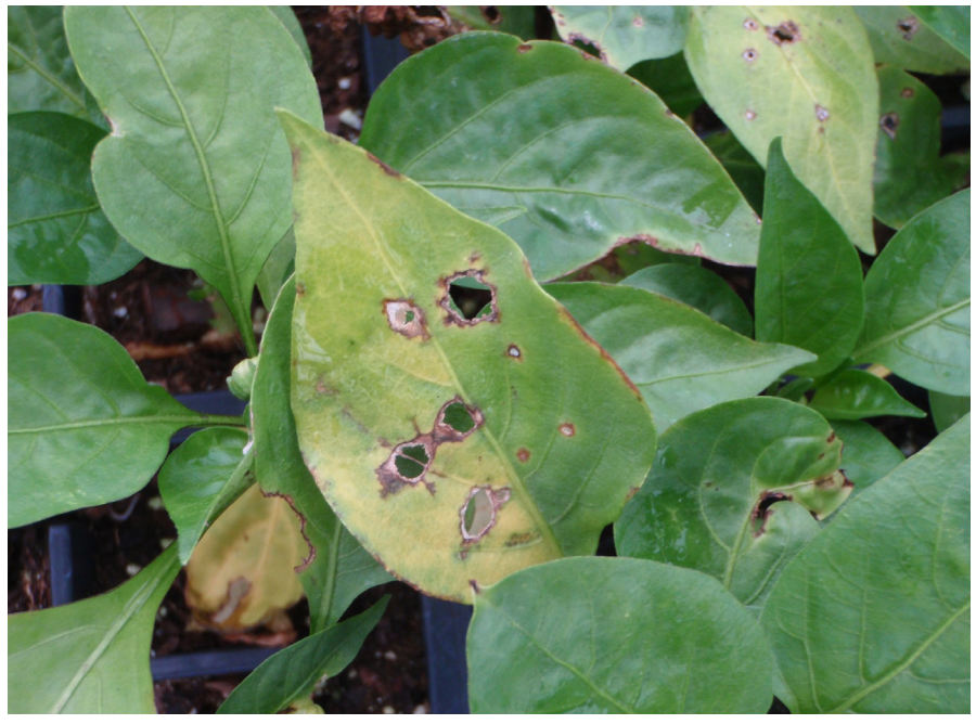
Figure 3. Over time, spots may coalesce and result in a blighted appearance of the lower or affected leaves.