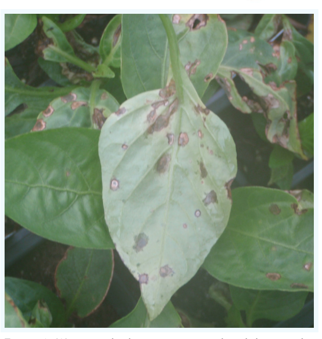
Figure 1. Water-soaked spots associated with bacterial leaf spot on pepper transplants.