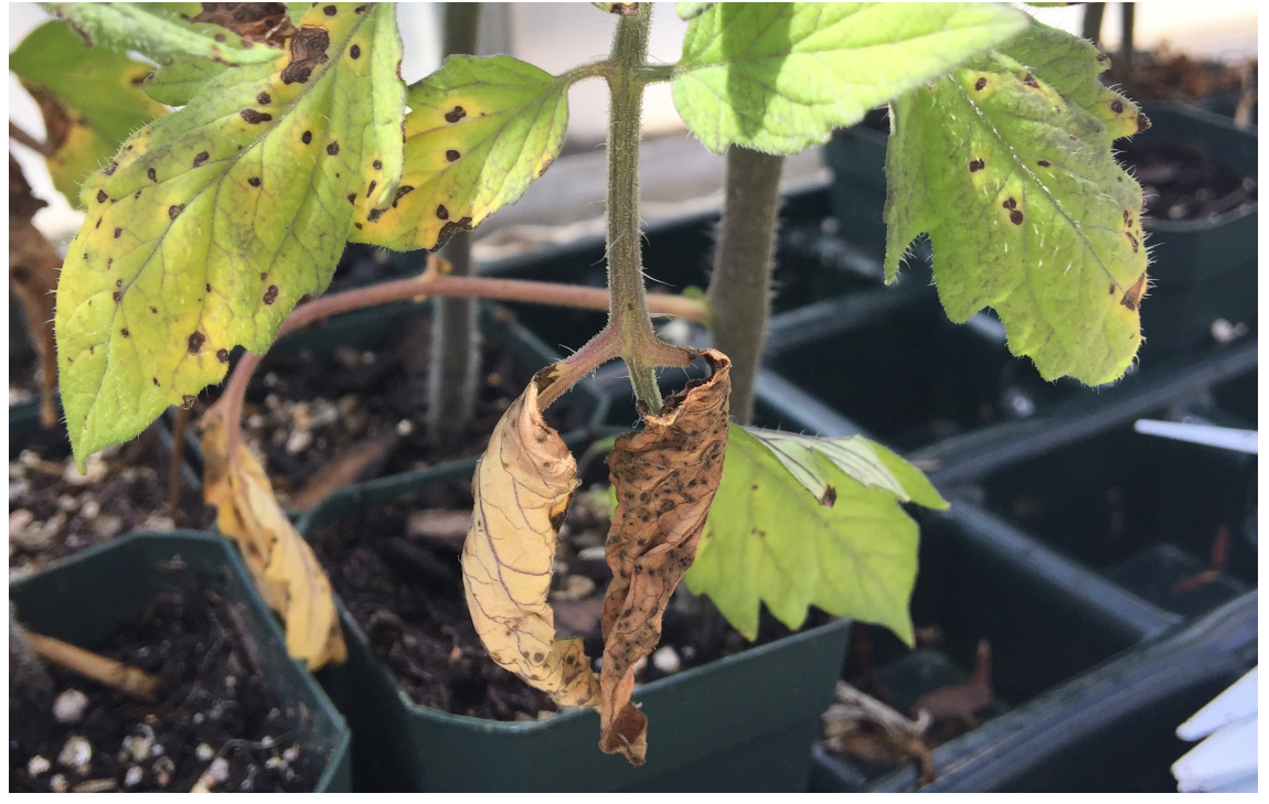
Figure 6. Over time on tomato, spots may coalesce and result in a blighted appearance of the lower or affected leaves.