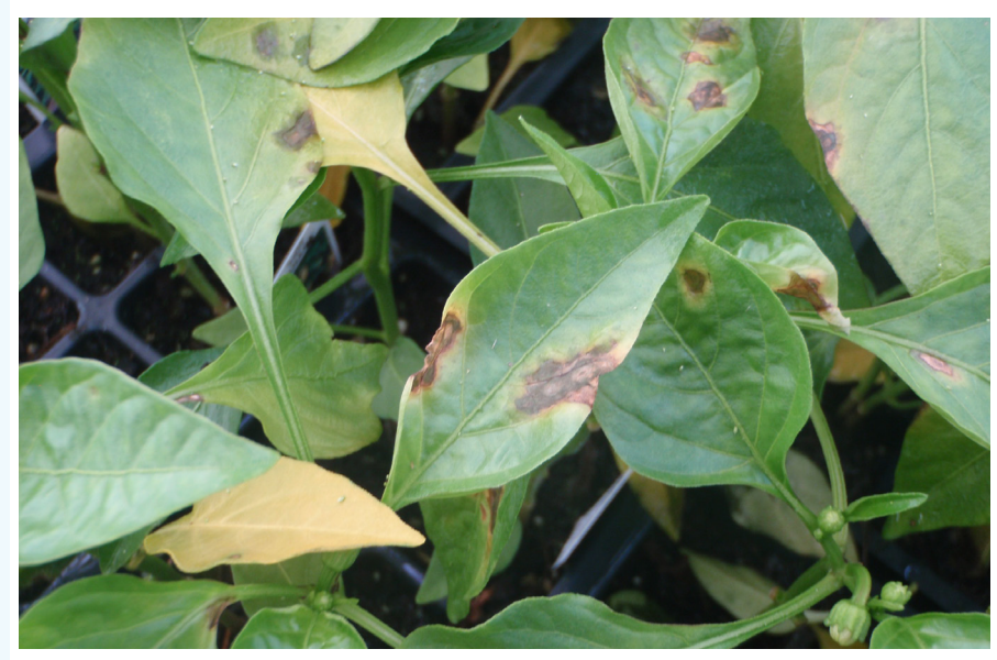
Figure 2. Bacterial leaf spot on pepper transplants. The spots turned dark brown and the area around the spots turned yellow.