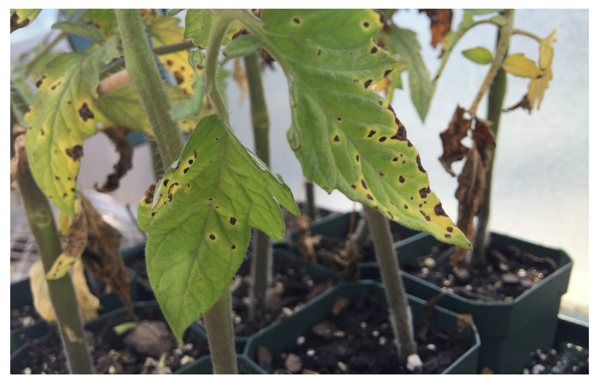
Figure 5. Bacterial leaf spot on tomato transplants. The spots turned dark brown and the area around the spots turned yellow.