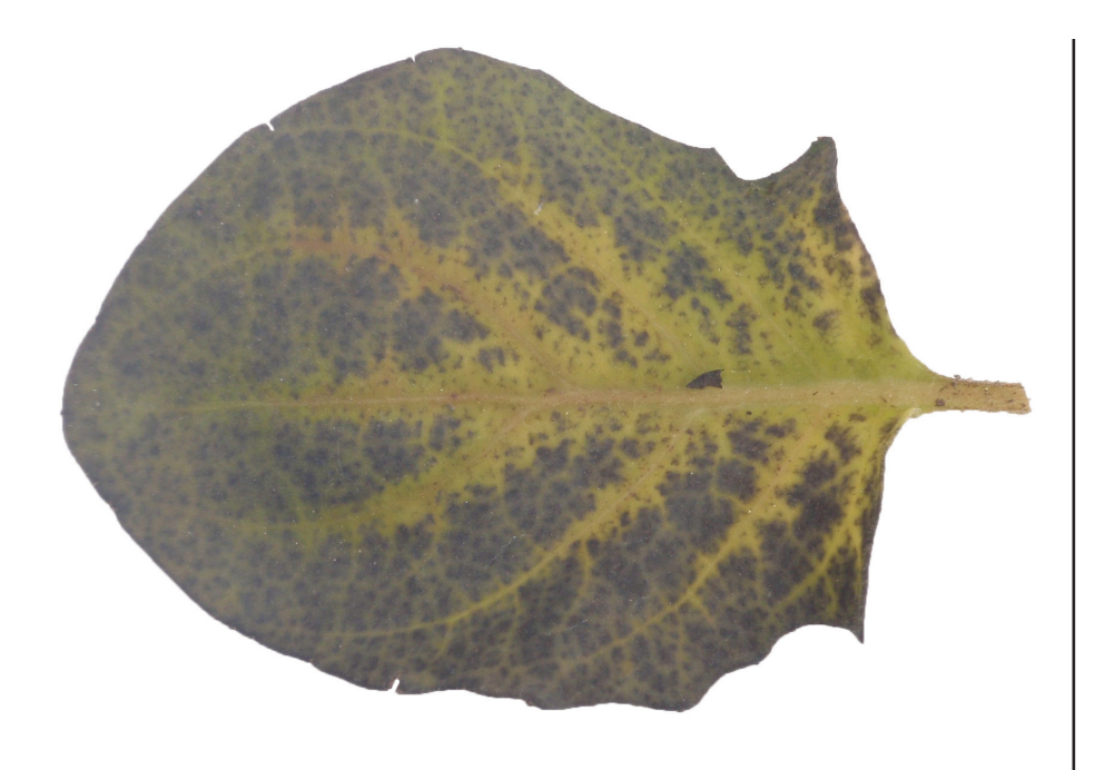
Figure 3. A pale yellow leaf color can also develop when symptoms become more advanced.

the pH is below the recommended range, then corrective procedures will need to be implemented. Flowable lime is one option. Typically a rate of 2 quarts per 100 gallons of water will increase the substrate pH by roughly 0.5 pH units. Two quarts can be used through the injector. Additional applications can be made if needed. Potassium bicarbonate can also be applied. The rate of 2 pounds per 100 gallons of water will increase the substrate pH by roughly 0.8 pH units. This treatment will also provide excessive potassium and cause a spike in the substrate electrical conductivity (EC). So the following day a leaching irrigation with clear water is required to restore the nutrient balance (the ratio of K:Ca:Mg) and lower the EC level. As always, remember to