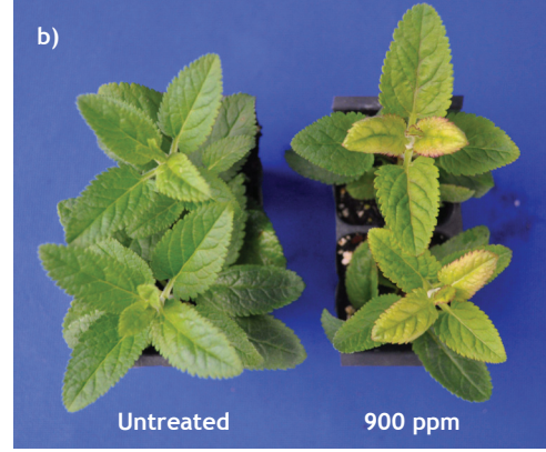
Figure 3. Veronica longifolia 'First Love' after Configure was applied as a foliar spray under a) Spring conditions (low relative humidity) at 0 (left) or 1200 ppm (photo 3 weeks after treatment); or, b) Summer conditions (high relative humidity) at 0 (left) or 900 ppm (photo 1 week after treatment).

And, on the Salvia , Veronica and Heliopsis , we had significant PHYTOTOXICITY!! The Phlox exhibited no phytotoxicity symptoms with only a slight increase in the number of lateral branches.