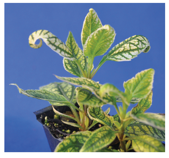
Figure 1. Phytotoxicity on Heliopsis helianthoides 'Loraine Sunshine' after application of 900 ppm of Configure in humid conditions.

In a Spring study we evaluated Configure spray application rates up to 1200 ppm on several recently rooted liners of herbaceous perennials, including Phlox paniculata 'Star Fire,' Salvia officinalis 'Aurea,' Veronica longifolia 'First Love' and Heliopsis helianthoides 'Loraine Sunshine.' We were surprised to find little effect of Configure on these crops since they had all been responsive in previous trials. In a followup study during the Summer, we again applied a single, relatively high rate of Configure, 900 ppm, to liners of these same cultivars. INOTE: We do not recommend rates this high on herbaceous perennials.] We had completely different results which included significant phytotoxicity (Fig. 1).