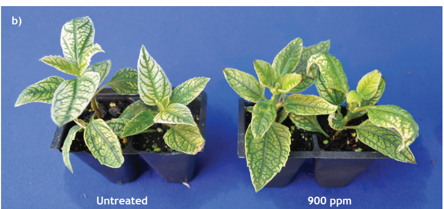
Figure 4. Heliopsis helianthoides 'Loraine Sunshine' after Configure was applied as a foliar spray under a) Spring conditions (low relative humidity) at 0 (left) or 1200 ppm (photo 3 weeks after treatment); or, b) Summer conditions (high relative humidity) at 0 (left) or 900 ppm (photo 1 week after treatment).